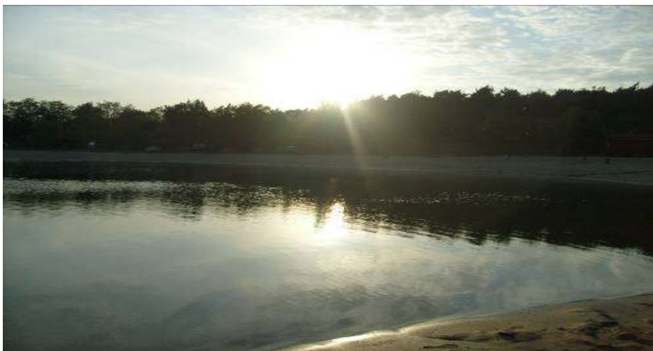
This is one of my favourite pictures. I take this photo at a lake in Holdorf, it's two hours away from Jever. I was there with a few friends and we were camping there for a weekend.