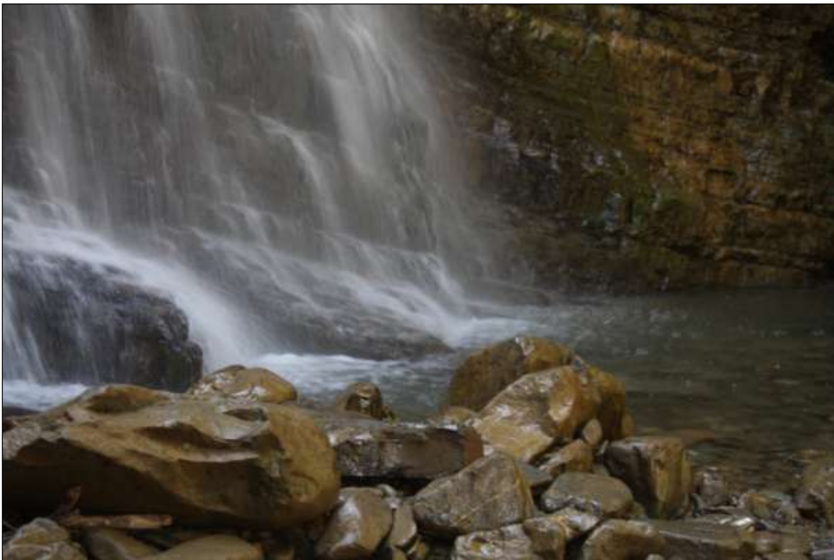
This is my photo with reflex camera. This is Maniavski Waterfall. I like to take photos with reflex camera, but it is very massive. Taking photos is very interesting and wonderful occupation. I'd like to connect my future with photography.

I saw photos of your class and I think you want to see me: