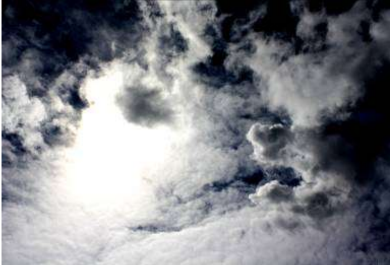
This one is on Lanzarote. Maybe you know Lanzarote, i don't know. I was there on holiday with a good friend. My friend took this photo, but i really like it.