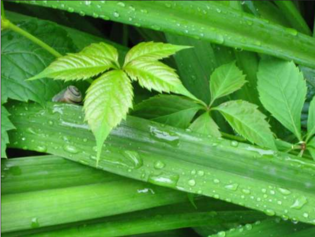
This is my best photo of grass.