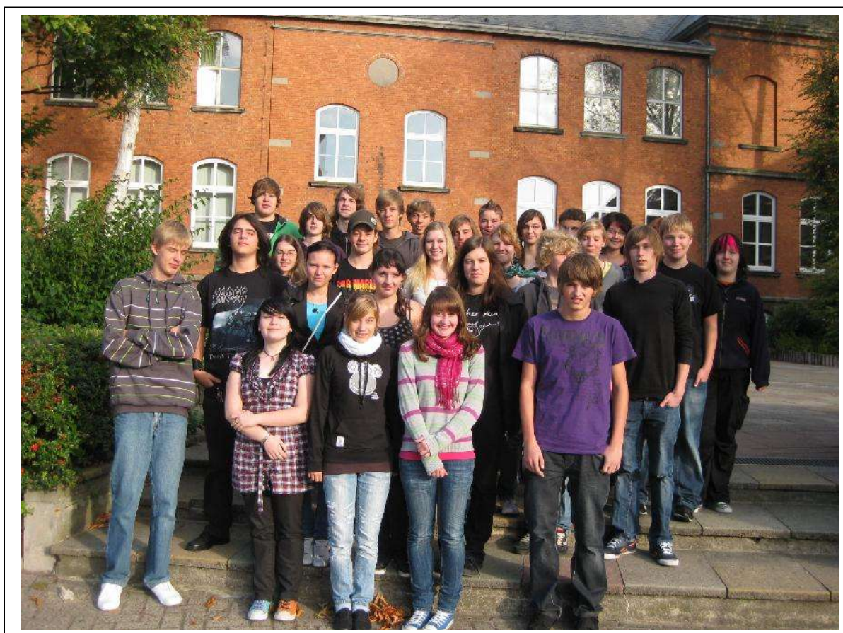
Class 10 b from Mariengymnasium Jever