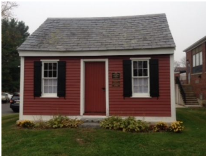
Above is our Little Red schoolhouse: The school before the new one. This is one of the original one-room schoolhouses in Franklin Township.