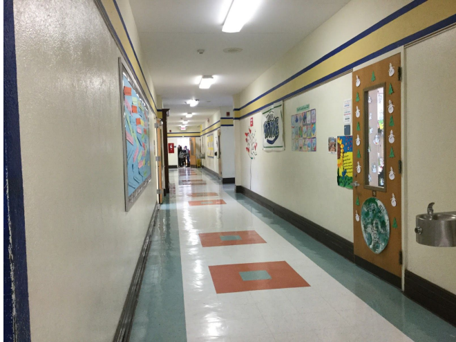
Above is a picture of inside of the school.