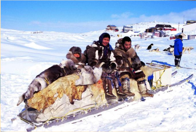
Life today in the Far North