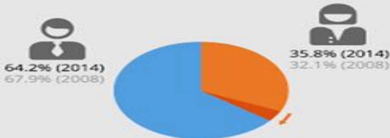
Figure 3. Gender distribution among leaders

GENDER EQUALITY IS NOT A WOMAN'S ISSUE. IT IS A HUMAN ISSUE. IT AFFECTS US ALL.