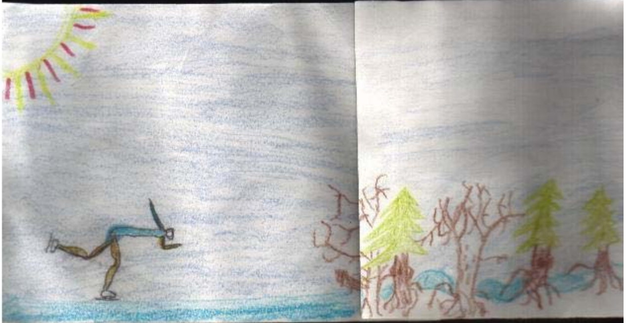
Speed Skating by Dylan Colored Pencil on Paper