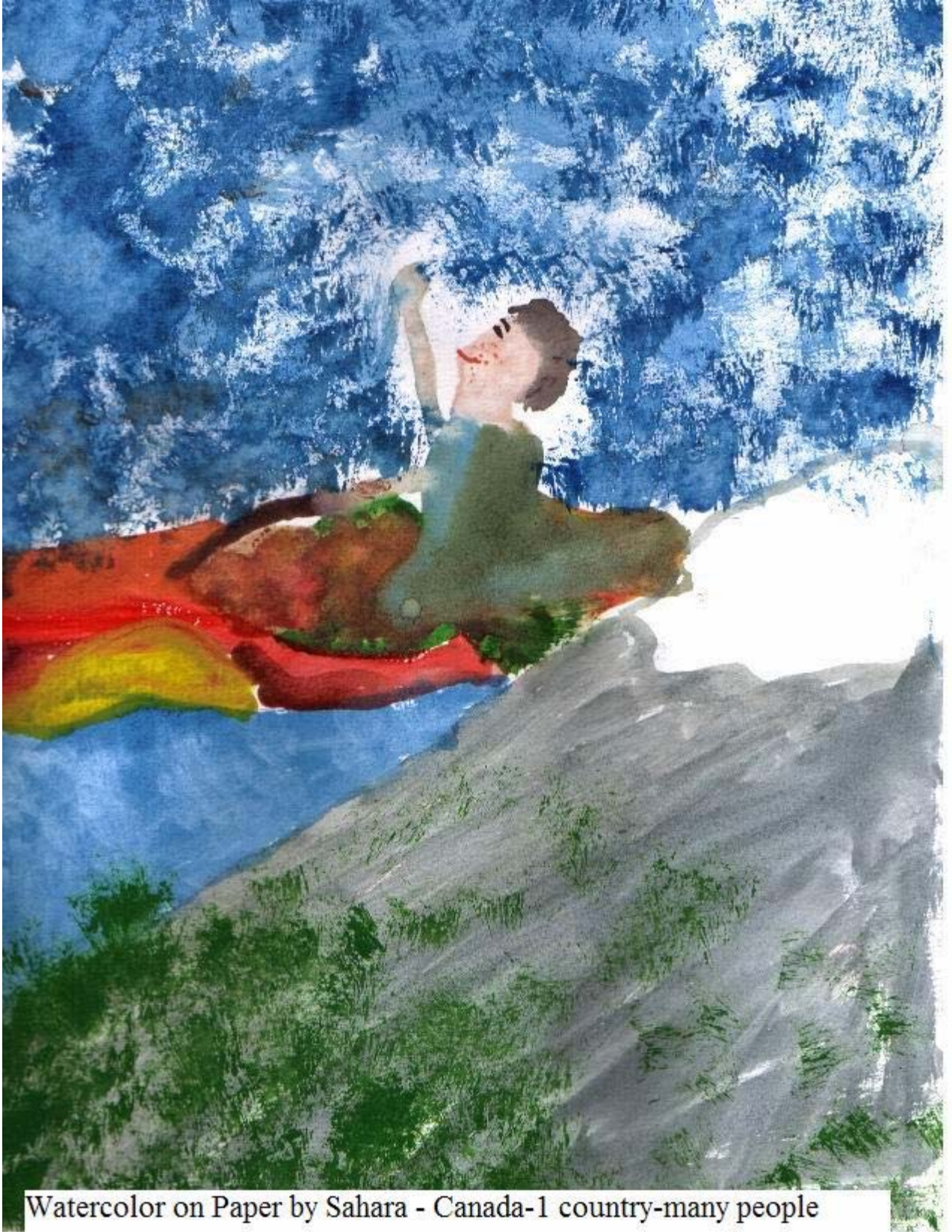
Watercolor on Paper by Sahara - Canada-1 country-many people