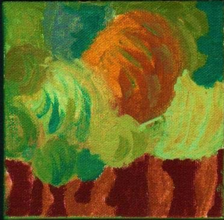
The Woods By Slater Paint on canvas