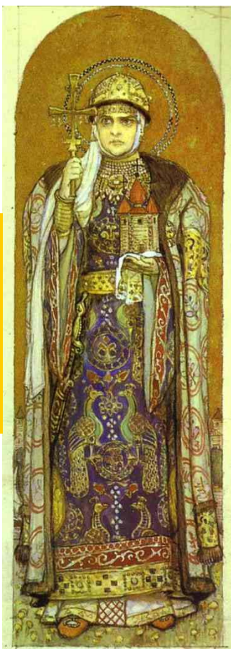
Kiev's princess Olga