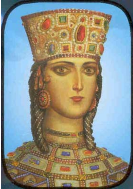
Tamar - King of Georgia