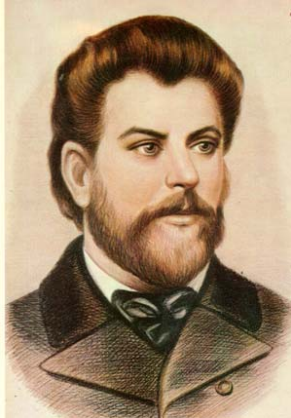
Ion Creanga, writer