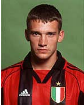
Andrey Shevchenko, footballer