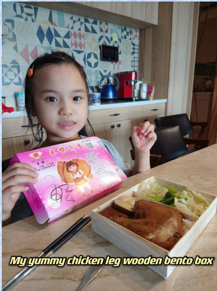
My yummy chicken leg wooden bento box